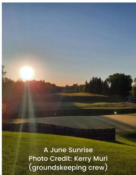
A June Sunrise Photo Credit: Kerry Muri (groundskeeping crew)